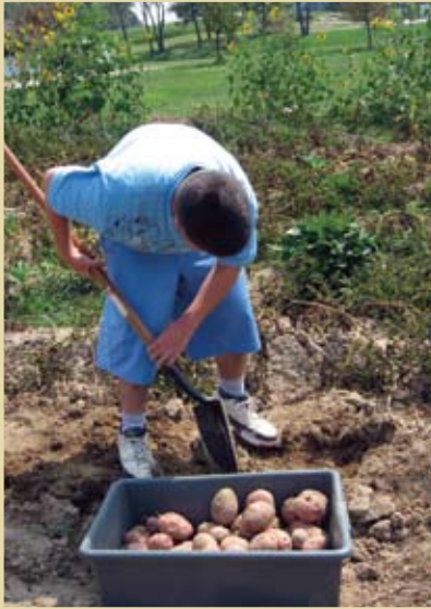
Potatoes are only one of several vegetables farmed in the Garden Therapy Program. The youth not only work the gardens, they develop a marketing plan, establish work groups and sell the produce.

When you walk by the garden in the summer, it looks like any normal garden during August. The potatoes are pretty much done. Tomato vines are hanging low with plenty of fruit. The flower garden is thinning but colorful.