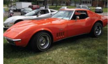
Race day excitement came in the form of remote control cars at the annual TVN-Boys' Village Campus Corvette Show. Corvette owners sponsored their favorite car and driver in the friendly competition. The cars were raced by the youth in Boys' Village residential program.

More than 150 Corvettes converged at The Village Network –Boys' Village Campus Sunday, Aug. 24th for the 10th annual Mid-Ohio Corvette Club Show. When the day's activities were over, $6,416 was raised for the Wooster Recreational Therapy program.