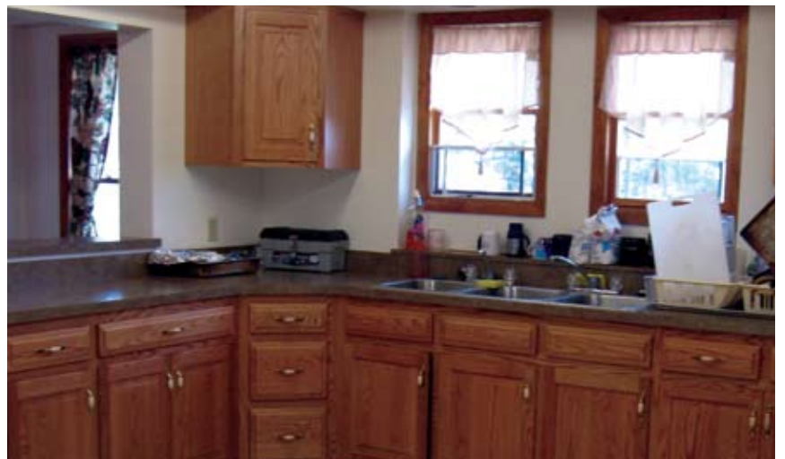
The Ohio State Aerie as well as Akron Aerie #555 and North Canton Aerie #2223 were instrumental in providing support for the renovation of Eagles Cottage.